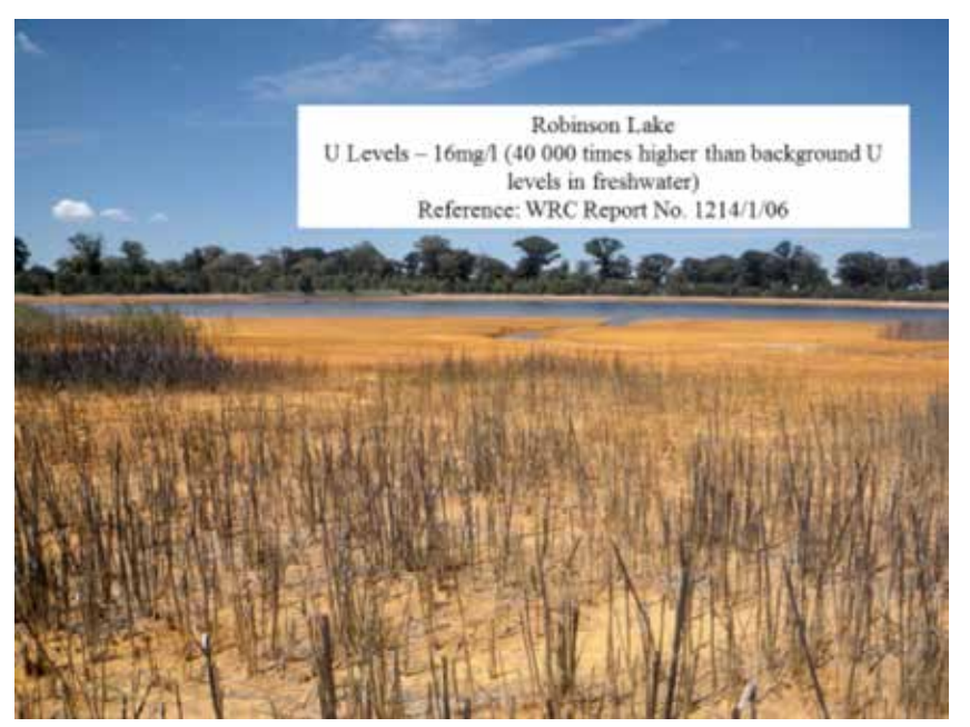
A view of Robinson Lake with South African Water Research Commission (WRC) insert.

Delegates met members of the Tudor Shaft informal settlement, living on the remains of a mining residue dump where the level of radioactivity is higher than the limits set for the Chenobyl exclusion area in Ukraine.